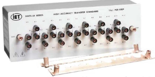
Model HATS-LR-10 Transfer Standard with HATS-LR-SB shorting bars

If one has a single standard that is calibrated by a national laboratory, one can then compare the transfer standards to the certified standard by ratio techniques. See p. 5 for a full tutorial.